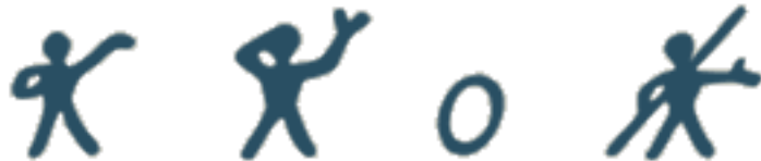
GOES TO ANOTHER ISLAND, SLEEPS TWO NIGHTS,