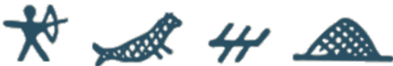
HUNTS AND KILLS A SEA LION AND RETURNS HOME.