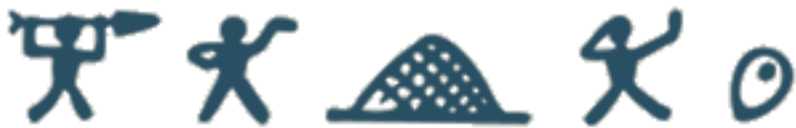
THE HUNTER LEAVES HOME, SLEEPS ONE NIGHT ON AN ISLAND,

The combination of these Pictograms tell the story of a hunter.