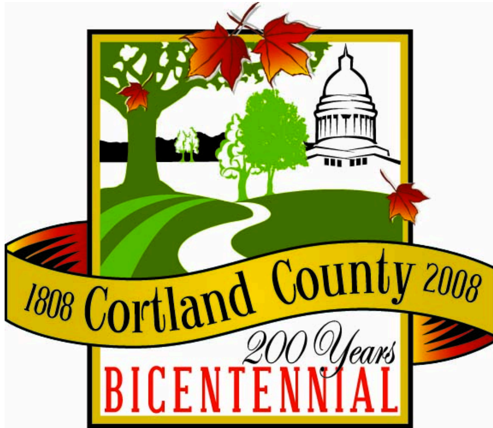
Cortland County: Busy and reliant on color

More Simple and relatable, easy to read in color and in black